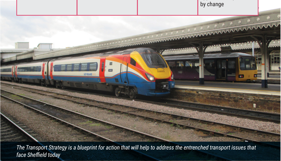
The Transport Strategy is a blueprint for action that will help to address the entrenched transport issues that face Sheffield today